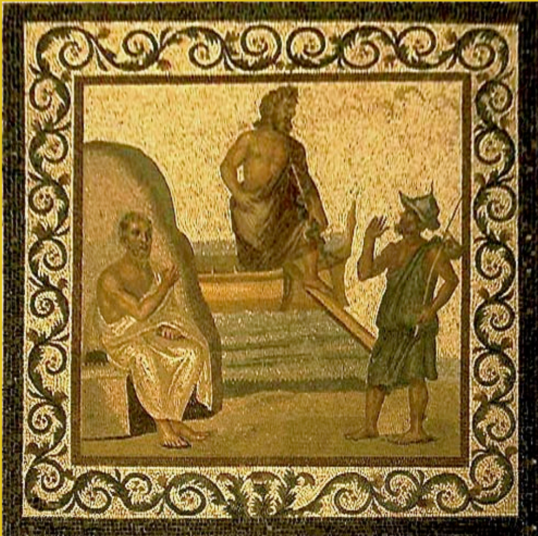
Asclepius visiting Hippocrates in Kos